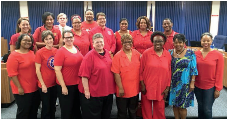
LAE members in Lafayette Parish send a message to school board members by wearing red to a board meeting.

When we think about the promise of education, we think about Louisiana’s children – our future leaders. We see our classrooms equipped with modern tools that help students prepare to make an impact on the world. We see students getting the educational experiences they need to thrive and educators having the support they need to help them do so. We see progress. We see promise. We see hope.