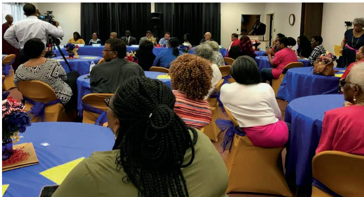
LAE members in Morehouse Parish hold a school board candidate forum to vet those running for the office.