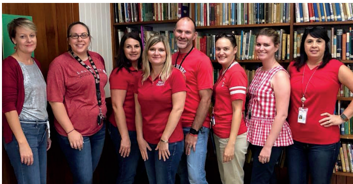
St. Landry Association of Educators members look sharp in their red outfits.

But today, we see school budgets being cut, overcrowded classrooms, outdated learning materials, and, underpaid school staff. We see educators working around the clock to make a difference in the lives of their students with little or no acknowledgment for their hard work and achievement. We also see these brave individuals beginning to stand up to lawmakers as they raise their voices together for their schools and their communities. We see bold advocates for change. We see a movement. We see Red for Ed .