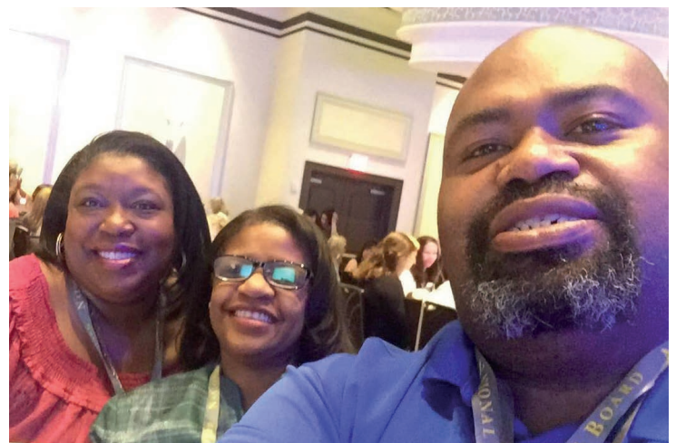
LAE national board-certified teachers at the 2018 National Board Academy Training planning next steps for offerings for NBCT-hopefuls in Louisiana.