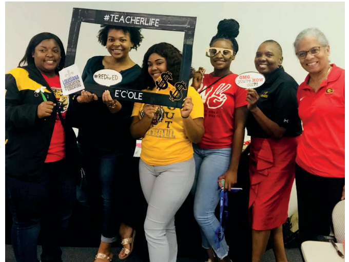
Conference attendees take a quick moment away from their hard work to get silly in the Early Career Cohort of Louisiana Educators' photo booth!

Those who attended had the opportunity to learn about early career success strategies, educator rights, student behavior, and so much more. Perhaps one of the most important takeaways from the conference was attendees having the opportunity to network with their peers, paving the way for collaboration with one another on future initiatives. To keep up with the work of LAE's early-career educators, check out lae.org/ecole .