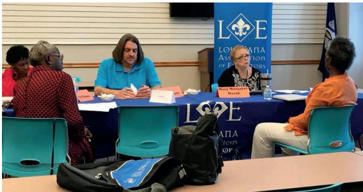
Lake Charles-area members interview candidates running for school board in Calcasieu Parish.