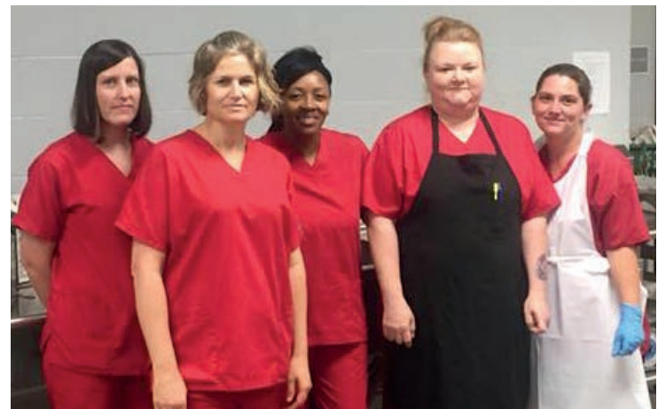
Food service workers in Lasalle Parish show their support for the Red for Ed movement.

Together, we are stronger. Add your voice to the many speaking as one. Join the Red for ED movement, TODAY!