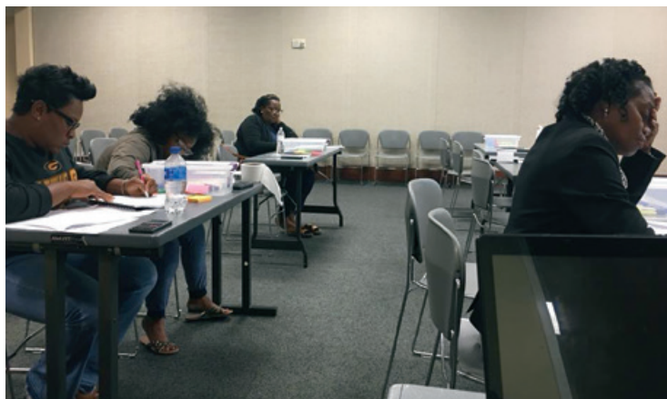
Intense focus fills the room at a Praxis I study session in Ruston.