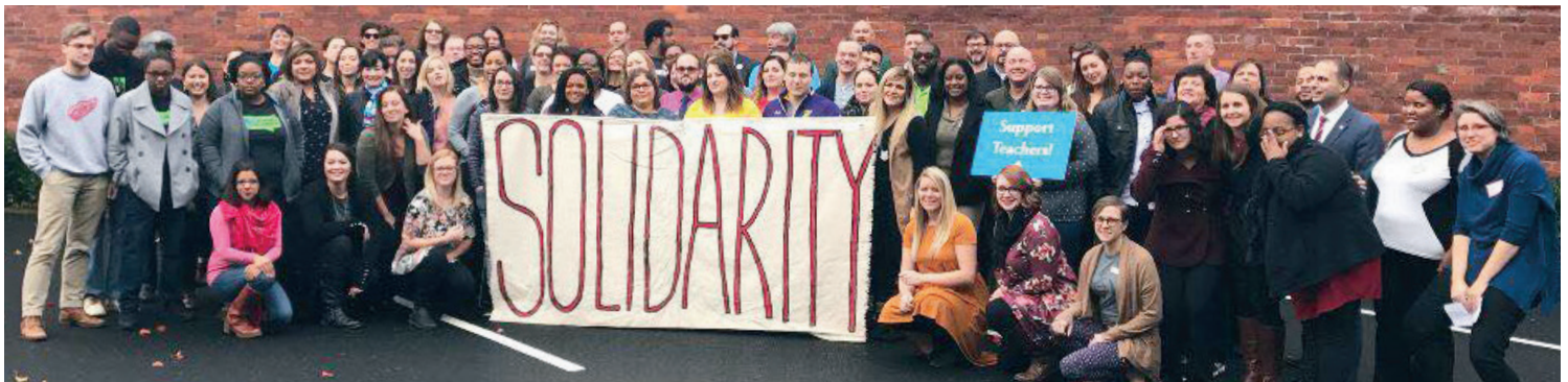
Early career educators from across the United States working hard in Portland, Oregon.