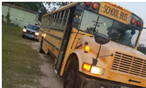
A school bus carrying concerned drivers from across the parish arrives at the Tangipahoa Parish School Board meeting on November 7.