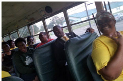
Concerned school employees prepare to take a stand in solidarity at the TPSB meeting.