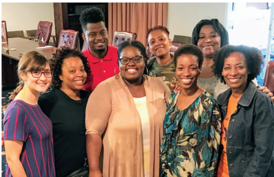
Louisiana NBCT candidates attend October 2017 JumpStart workshop in Baton Rouge.