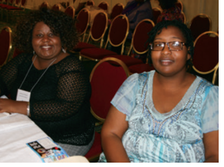
the 2016 LAE RA activities.