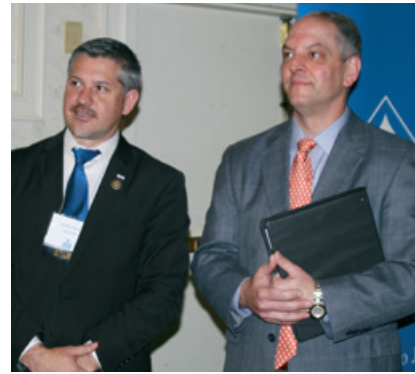
LAE Representative Assembly.