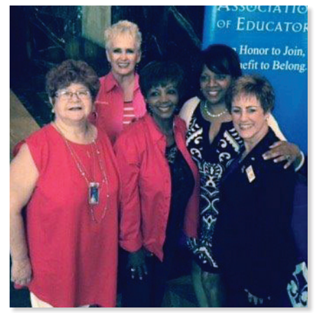
The LAE crew at Educator Appreciation Day.

teacher evaluations from 50 to 25 percent. Senators saw little need to act upon the proposal due to the current suspension of VAM. The LAE, LASPA, and several school district superintendents worked with Senator Mills to author the legislation.