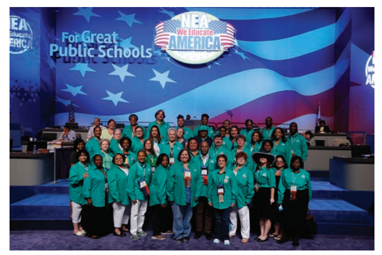
Louisiana delegates attend the 2015 NEA Representative Assembly in Orlando, FL.

LAE representatives were among the 7,000 educators from all 50 states who gathered in Orlando, Florida, this summer to attend the NEA's 94th Representative Assembly (RA)—the top decision-making body for the nearly three-million-member association. Embracing the meeting's theme, NEA: Unite. Inspire. Lead. , Louisiana delegates joined their colleagues to tackle issues with farreaching implications for the profession. Delegates passed two high-profile new business items (NBIs) addressing the importance of focusing on shared responsibility for our educational systems across the nation.