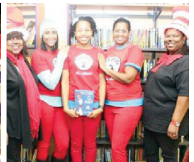
Teachers dress up for Dr. Seuss Day at Thomas Jefferson Upper Elementary School.