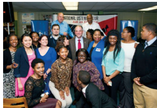
Governor Edwards joins Broadmoor High School educators and students for a quick photograph after the Listening Tour event.