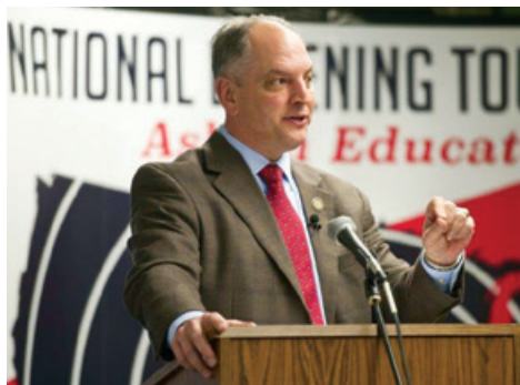
Governor Edwards addresses the crowd at Broadmoor High School as he offers remarks on the state of education in Louisiana.

The LAE team kept the momentum of the event going with a series of school visits across the state. Find out more about the progress made, within this issue.