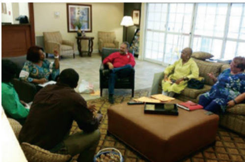
The LAE UniServ team debriefs after a day of listening tour events in Livingston Parish.