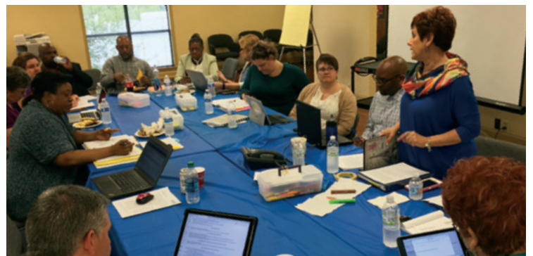
The LAE ESSA Implementation Team brings the Rockville, Maryland work back home as they work together to prepare Louisiana-specific items for distribution.