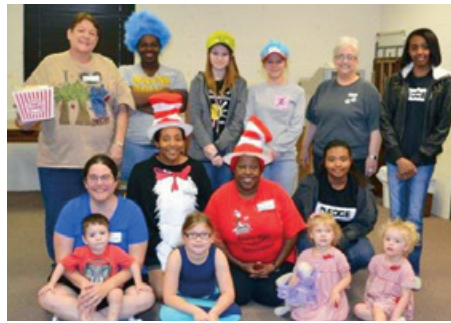
Acadia Association of Educators host "Dr. Seuss Fun Day" at the Rayne Public Library.