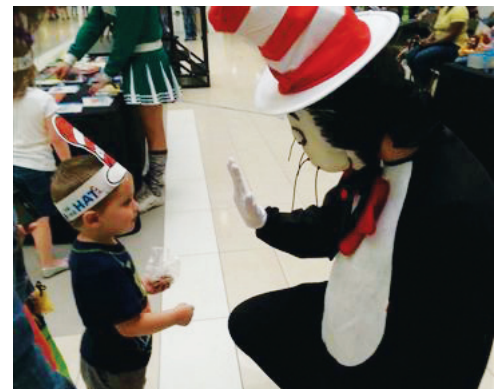
The Cat in the Hat mingles with kids while celebrating reading in Shreveport.