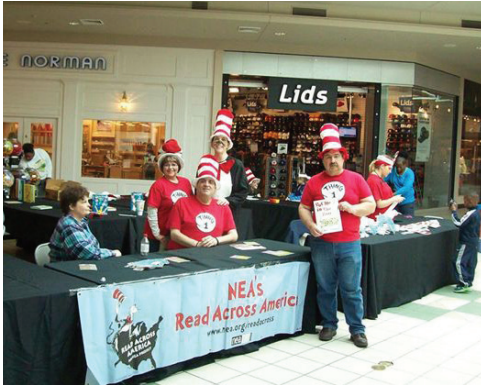
Members of the Calcasieu Association of Educators take a quick moment to take a picture during the Read Across Louisiana celebration at Prien Lake Mall.