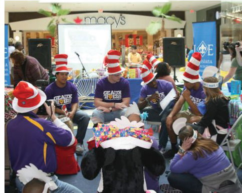
Members of the LSU football and track teams mingle with kids as they celebrate Dr. Seuss!