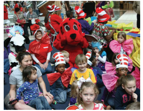
Baton Rouge children gather alongside Clifford the Big Red Dog and the Chic-Fil-A Cow to hear a book read by a local celebrity.