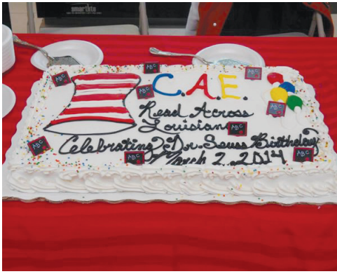
Members of the Caddo Association of Educators honor Dr. Seuss' birthday with a huge cake!