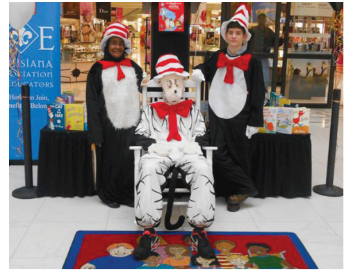
A crew of cats in hats at the Caddo Association of Educators' Read Across LA celebration.