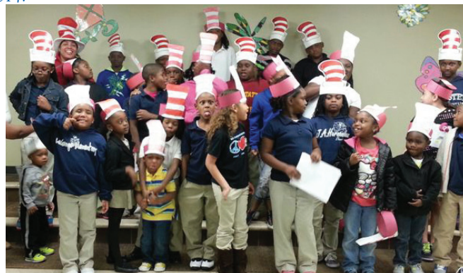
A group of kids in St. Mary Parish get silly as they celebrate reading!