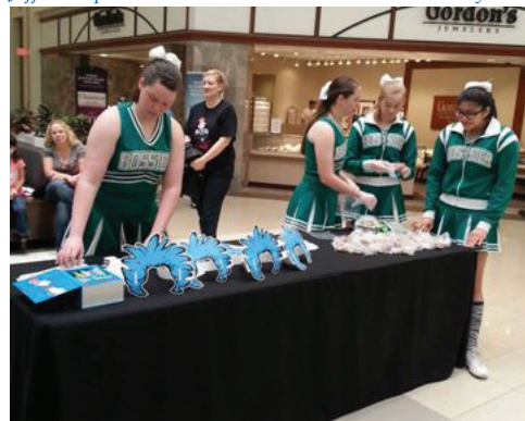
Cheerleaders from Bossier High School help make hats and pass out books to participants at Bossier's Read Across Louisiana celebration.