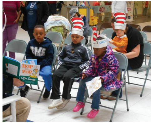
Shreveport-area kids listen to a special guest read, "Hop on Pop."